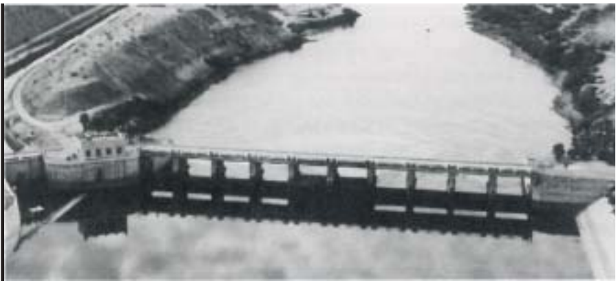
A downstream view of Headgate Rock Dam with the water level lowered at the dam.

Most dams have buoys and log booms or cables stretched across the water on the up and downstream sides. The booms or cables may be difficult to see even in daylight. Cables on a dam approach can be suddenly lethal if not seen.