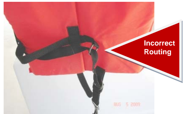
Kent Sporting Goods Lifejackets Shown Above

Distributed by the Office of Investigations and Analysis: http://marineinvestigations.us