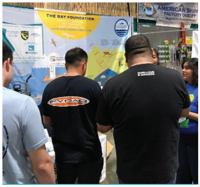
Spectacular Dockwalking by the Conservation Corps of Long Beach

Don't miss meeting with Dockwalkers at Marina del Rey's <u>Marina Fest</u>, held June 20-21, to learn how to make a positive impact while on the water.