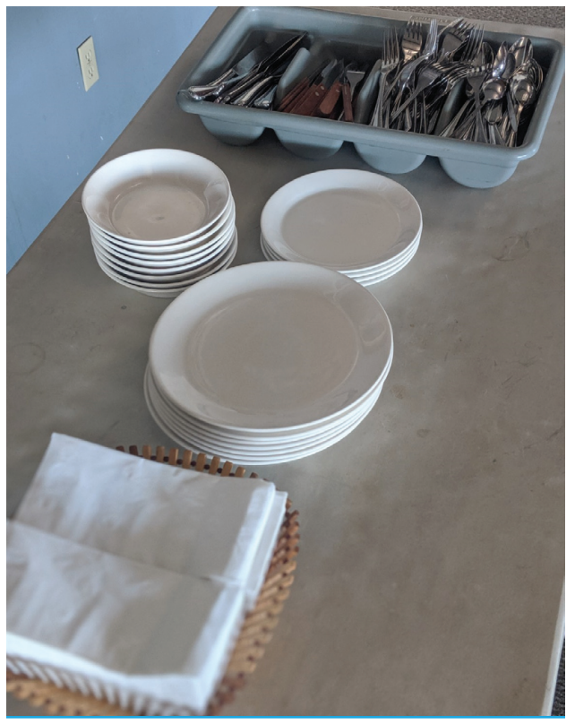
Before (top) and after (bottom) use of foodware at Berkeley Yacht Club

Note: Sequoia Yacht Club and Half Moon Bay Yacht Club (San Mateo County) also volunteered to participate in this pilot project. However, they were not officially selected to participate because they were already using reusable foodware in their daily operations.