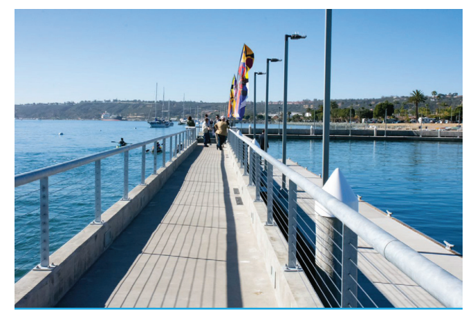
Public walkway at new Shelter Island Boat Launch

The project has been years in the making and included extensive public outreach. In November 2015, the California State Parks' Division of Boating and Waterways awarded the Port $6.1 million in grant funding for the project. In March 2016, the State of California Wildlife Conservation Board awarded the Port $3.5 million for the boat launch facility. The funding allowed the Port to move forward with the project, which completely demolished the former Shelter Island Boat Launch Facility and replaced it with a larger, more modern and safer facility.