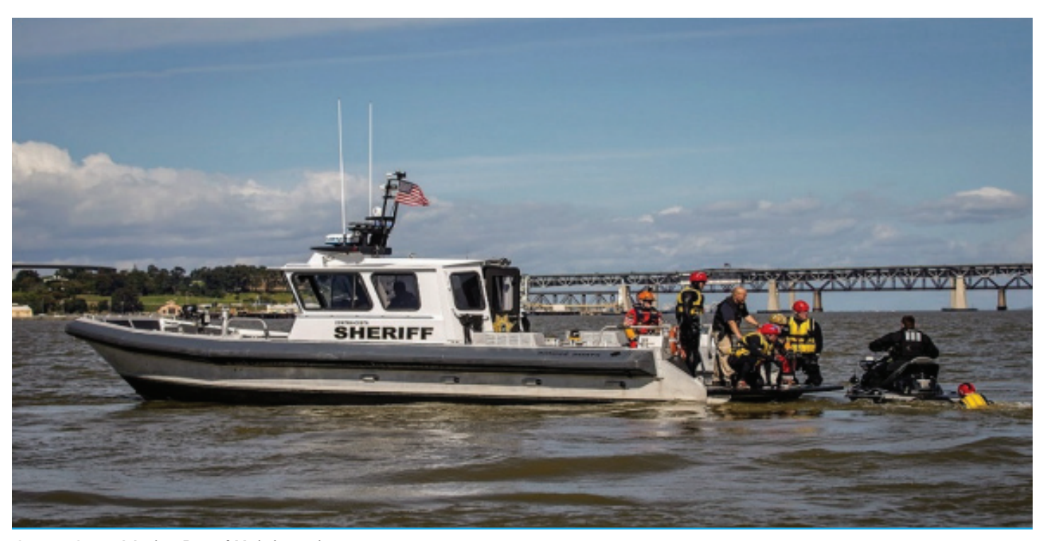
Contra Costa Marine Patrol Unit in action

Who they are: Marine police officers are specially trained to enforce boating laws in maritime environments. They may also have unique qualifications such as having a scuba-dive certification, marine firefighter operation skills or experience using rescue watercraft.