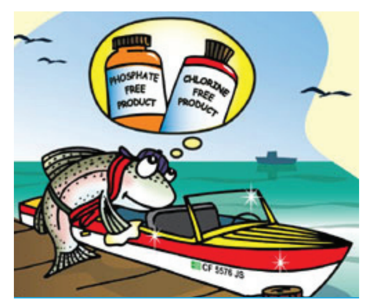
Choose cleaners that will not have a negative impact on ocean life

Do not forget the system hoses! Over time, these rubbery hoses begin to absorb the smell of sewage. Perform the following quick test: soak a rag with hot water and put it around the hose for a few minutes, remove the rag and smell it away from the hose. If the rag smells like sewage, it means the odor is permeating through and it is time to change the hose.