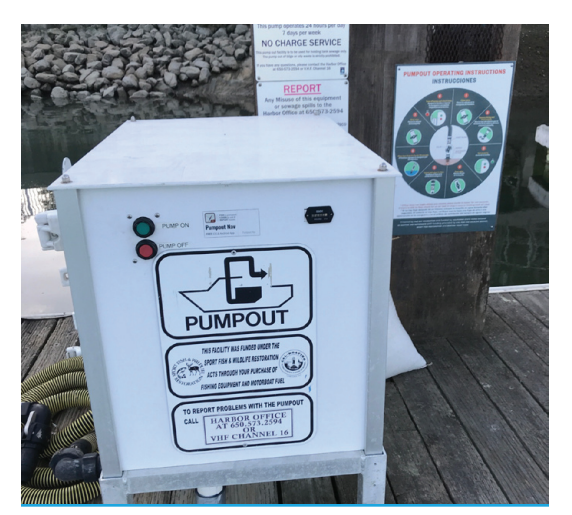
Prevent pollution: pump out!

In 1922 Coyote Point became Pacific City Amusement Park, which included a boardwalk, children's playground, scenic railway, Ferris wheel and merry-goround. However, the park was closed due to a fire that destroyed about one quarter of the development. After this incident, the land was turned into the Pacific Coast Cadet Corps, which was used for merchant marine training. The program was disbanded in 1946, and the land became the College of San Mateo until 1962.