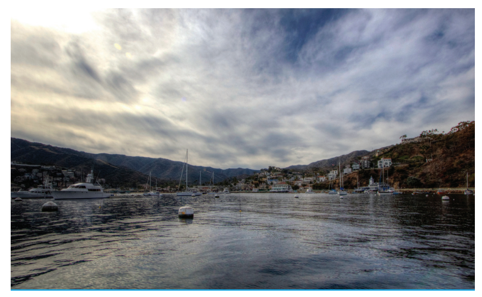
Avalon Harbor

Two Harbors is known as an "outdoor lover's paradise" and is located at the western end of Catalina Island. Moorings are available; for pricing and reservations (two-night minimum during weekends, three-night minimum during holiday weekends), go to www.visitcatalinaisland.com. A sewage pumpout is seasonally available at the Isthmus Pier, in addition to a free mobile pumpout service available in Cat Harbor.