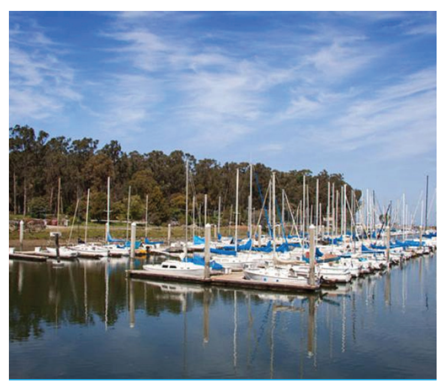
Coyote Point Marina, North Dock View

Now the park is open to the public and features picnic areas, the Captains House Conference Facility, a rifle range, Magic Mountain Playground, the marina and many trails for walking and biking.