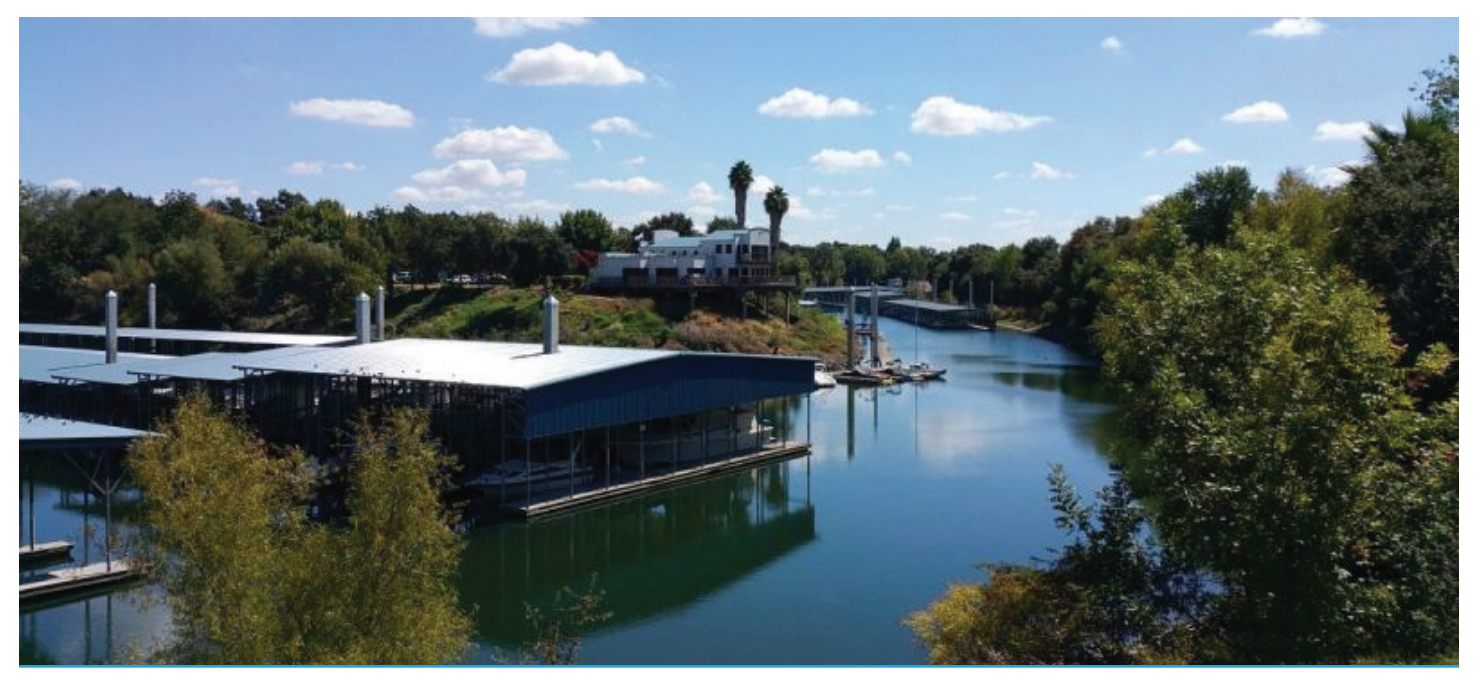
Sacramento Marina

Last year saw the creation of California's first National Heritage Area (NHA), extending from Sacramento in the north, to Stockton in the east, to the Carquinez Strait in the west. The Delta National Heritage Area, managed by the Delta Protection Commission, comes out of a years-long vision for the Delta as a unique, cohesive, nationally important place.