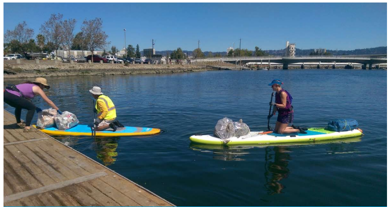
Active Volunteers at the Jack London Aquatic Center

The California Coastal Commission and the California State Parks Division of Boating and Waterways would like to thank the boating facilities, boating groups, coordinators, and partners for their participation. Click here to learn which boating facilities participated in this year's California Coastal Cleanup Day.