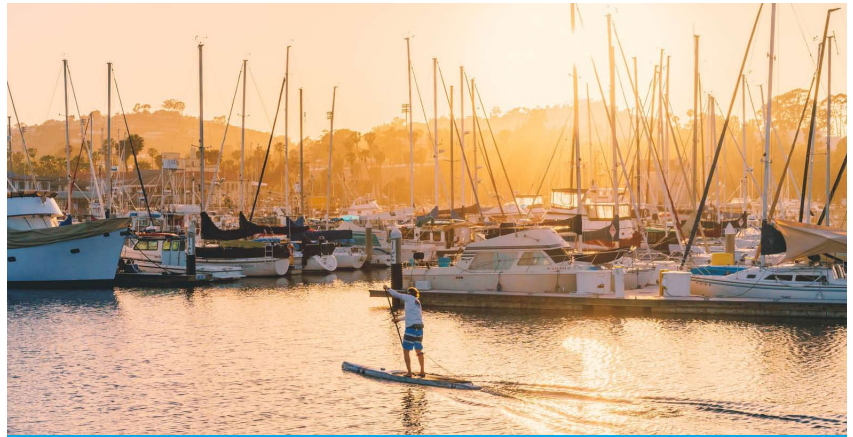
Paddleboarding in Santa Barbara Harbor

Santa Barbara Harbor is a Southern California boating gem with its gorgeous Santa Ynez Mountain backdrop, wide-ranging recreational opportunities and commitment to environmental responsibility. Built in 1926, this 1,139-slip harbor has become a popular destination for recreational boaters, anglers and tourists alike. The harbor, wharf and downtown State Street provide something for everyone: whale watching, fine dining, wine tasting, kayaking, historical sites and much more.