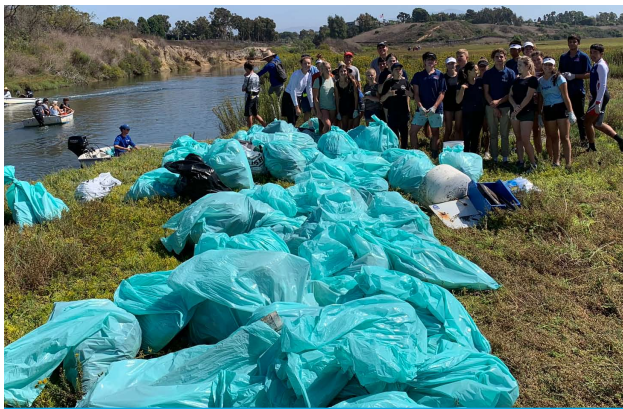
Active Volunteers in Newport Bay

Our state celebrated the 35th anniversary of California Coastal Cleanup Day (CCD) on September 21. The boating community demonstrated its interest and commitment to keeping coasts and waterways clean in both 2019's state and international effort.