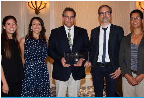
Accepting the Outstanding Service Award at the States Organization for Boating Access conference

The San Francisco Estuary Partnership, in collaboration with the California State Parks Division of Boating and Waterways and The Bay Foundation, were awarded an Outstanding Service Award by the States Organization for Boating Access. This organization's mission is to encourage, promote and support federal and state programs that provide safe, high-quality, and environmentally sound public recreational boating access to the waterways of the United States and its' territories.