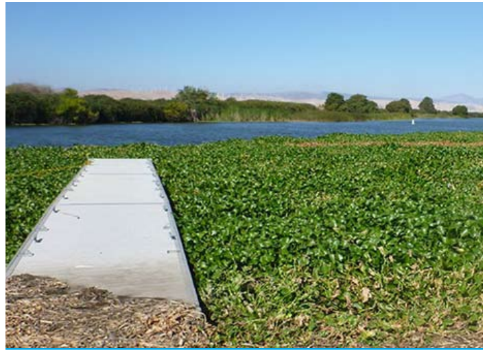
Aquatic invasive plant species in the Sacramento Delta

Treated areas are regularly monitored to ensure herbicide levels do not exceed allowable limits. A key element of DBW's monitoring program is ongoing collaboration with regulatory entities and reviewing new information to inform and improve control programs. Their use is carefully controlled and has been reviewed and approved by the U.S. Fish and Wildlife Service, National Marine Fisheries Service, California Department of Pesticide Regulation, the State Water Resources Control Board and County Agricultural Commissioners' offices. Additionally, all herbicides are registered for aquatic use with the U.S. Environmental Protection Agency and California Department of Pesticide Regulation.