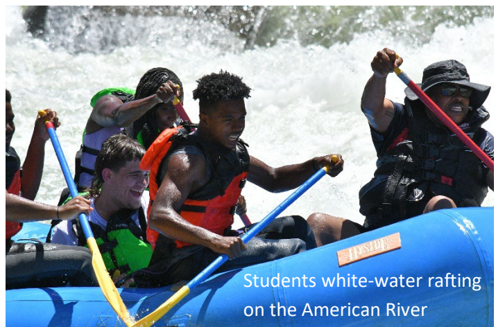
Students white-water rafting on the American River

The following tables provide information on aquatic center grants awarded and applications received but not awarded during fiscal years 2019/2020, 2020/2021, and 2021/2022. Aquatic center grant applications for fiscal year 2022/2023 are still being reviewed and scored. There is $1.6 million available to award during this fiscal year. DBW received 48 applications requesting just over $1.57 million in funding.